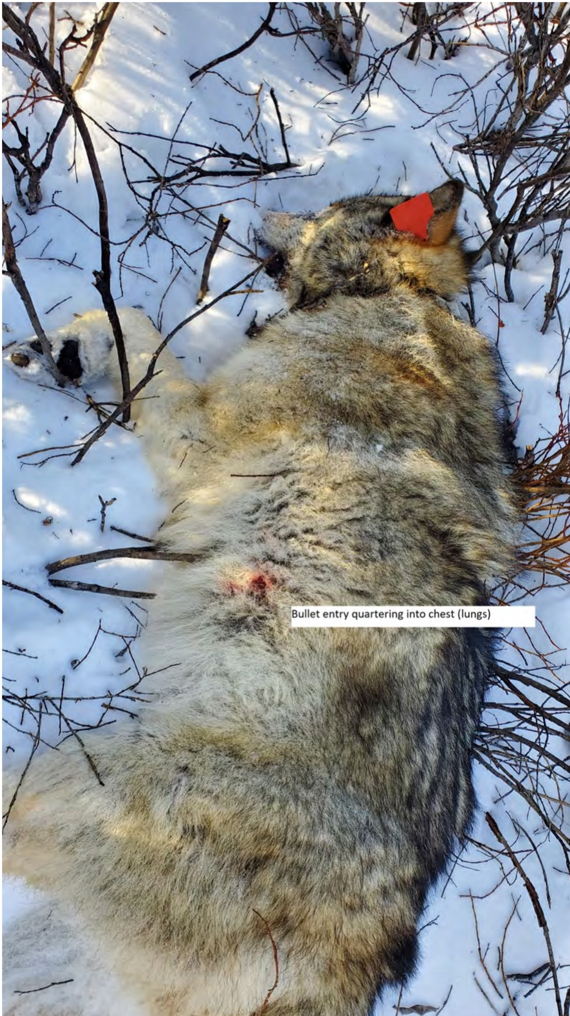
Bullet entry quartering into chest (lungs)