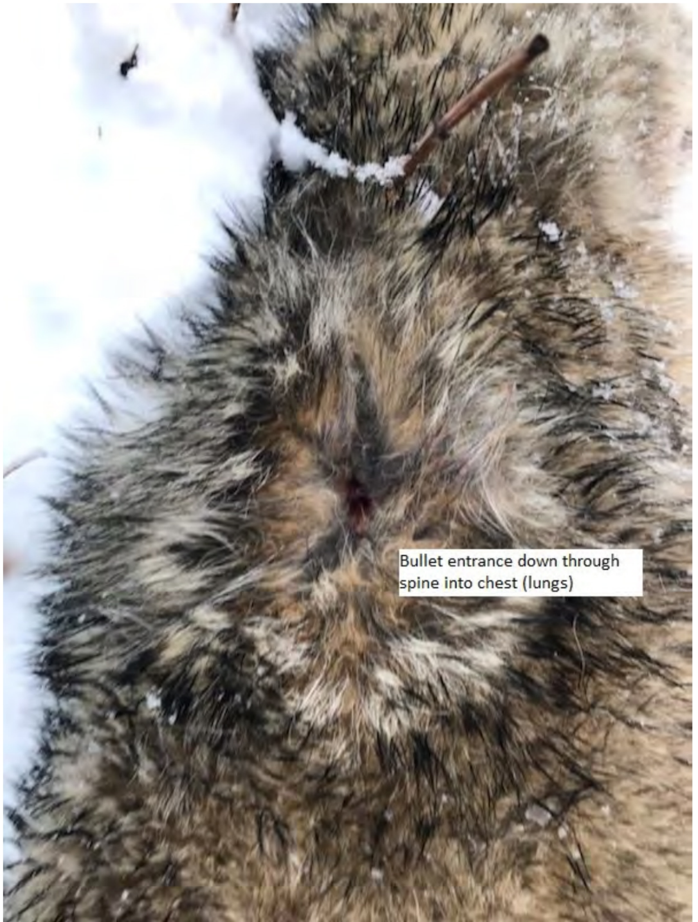
Bullet entrance down through spine into chest (lungs)