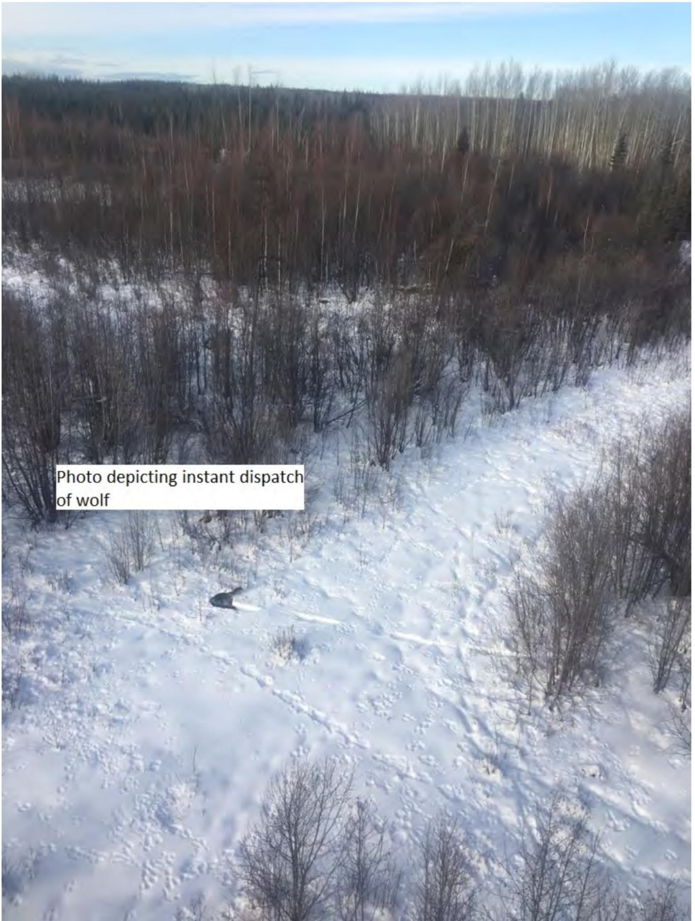
Photo depicting instant dispatch of wolf