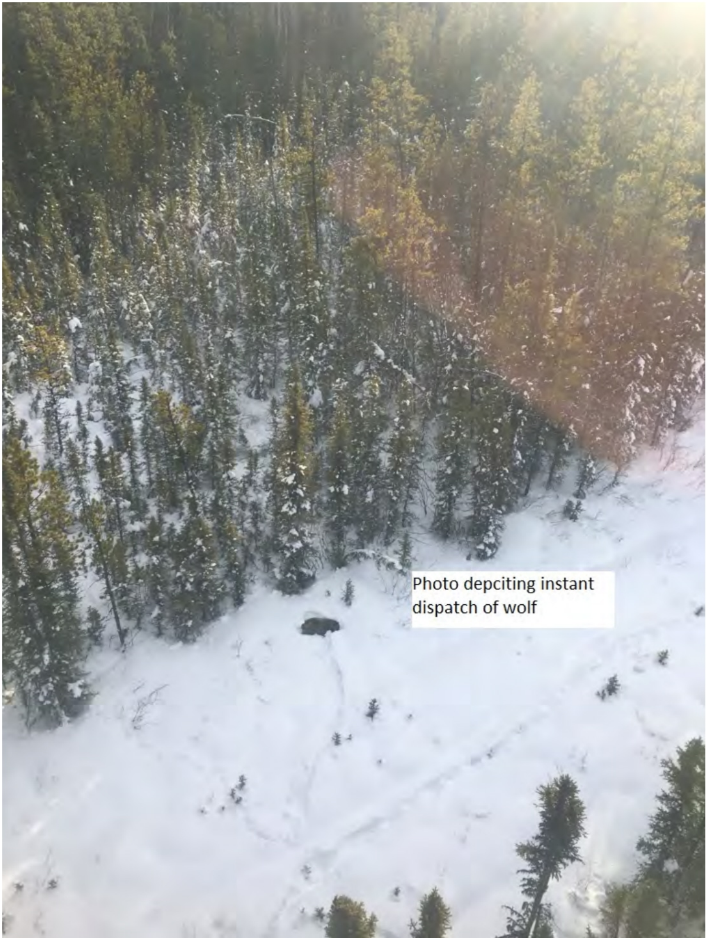
Photo depicting instant dispatch of wolf