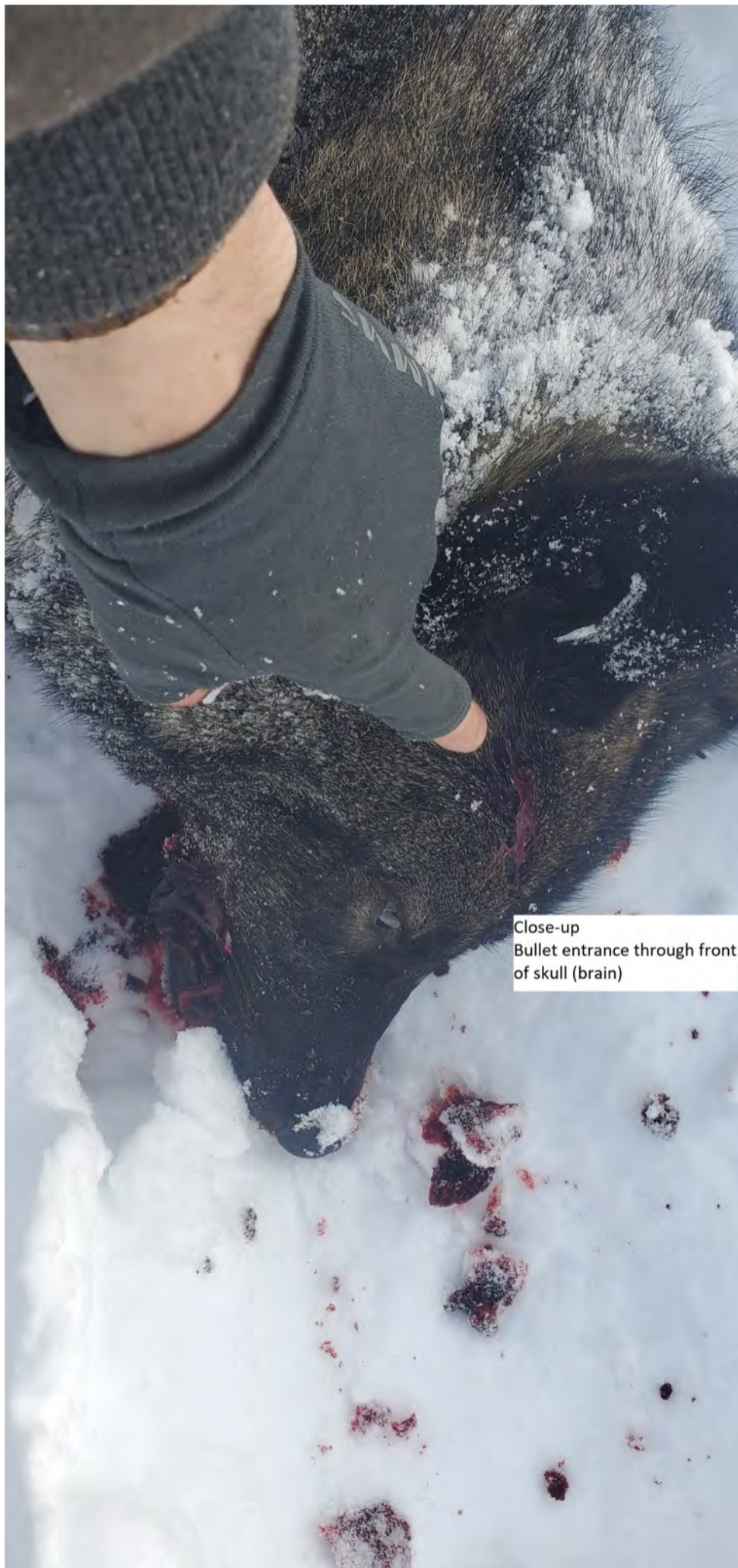
Close-up Bullet entrance through front of skull (brain)