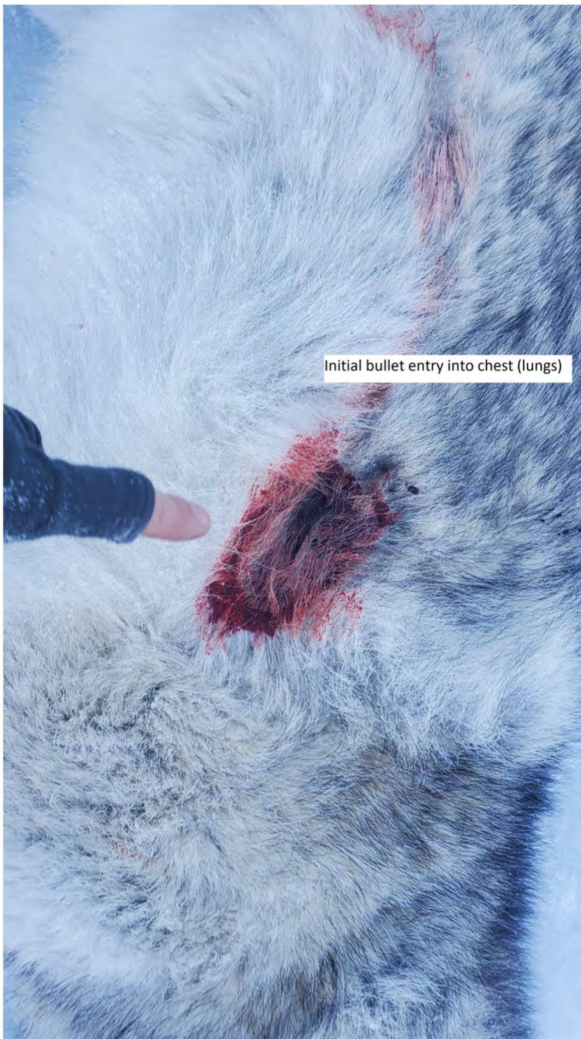
Initial bullet entry into chest (lungs)