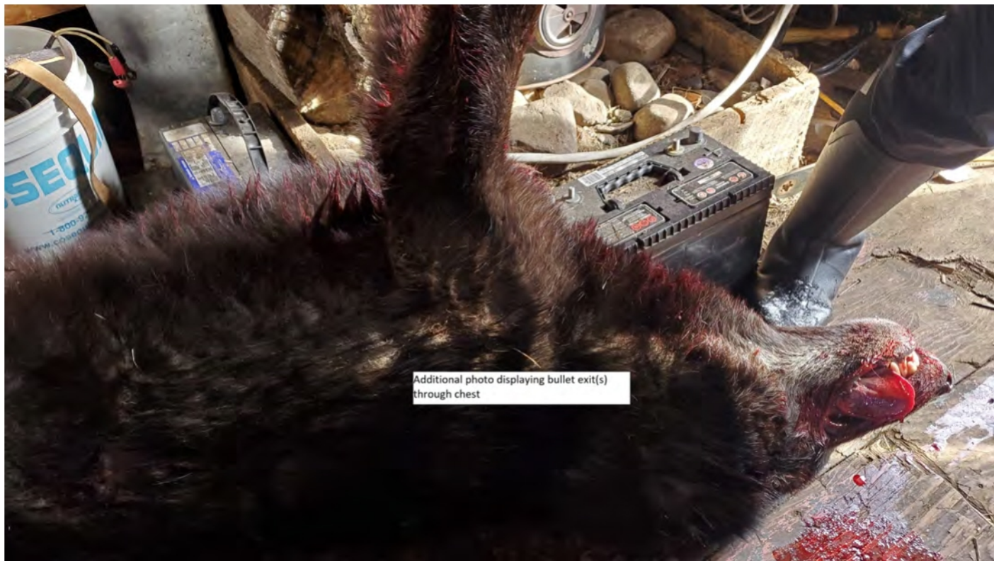
Additional photo displaying bullet exit(s) through chest