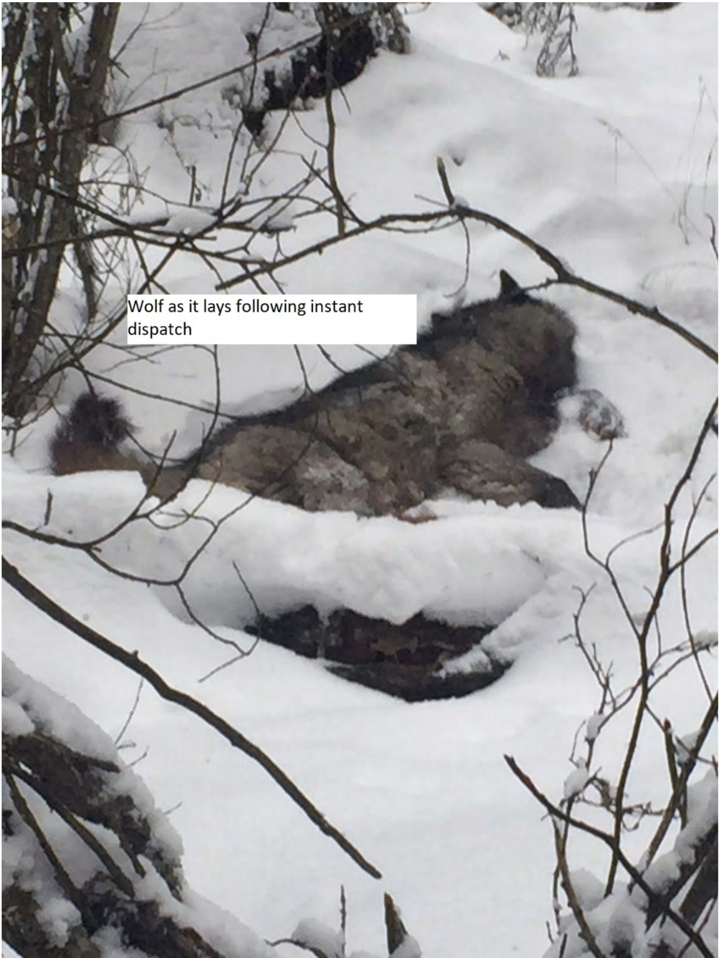
Wolf as it lays following instant dispatch