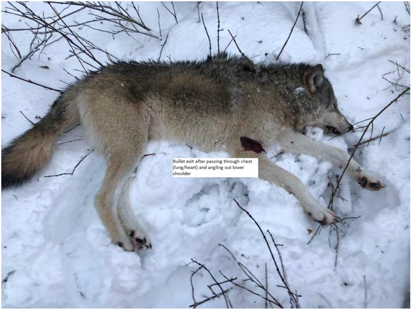
Bullet exit after passing through chest (lung/heart) and angling out lower shoulder