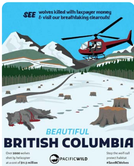
Our parody tourism poster highlighting the irony of B.C.'s environmental mismanagement gained attention world-wide online and on bike racks across Vancouver.

With your help, Pacific Wild continues to push governments to do better for wildlife and challenge outdated attitudes that rank the value of one animal over another. Send a letter to the Province calling for real action to save caribou and stop the wolf cull.