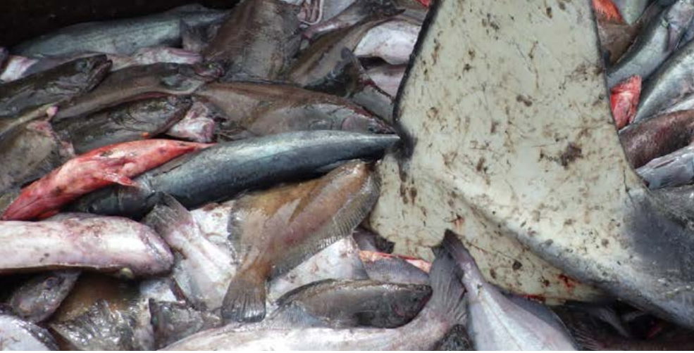
Bycatch on the deck of an Alaskan trawl vessel.